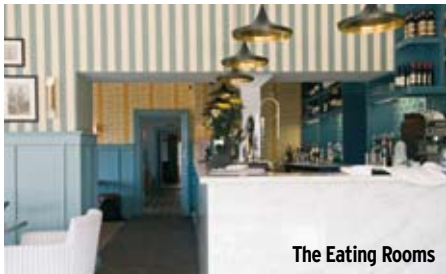
The Eating Rooms

• Buy it at The Holt Bookshop, 10, Appleyard, Holt. NR25 6AR. Tel: 01263 715858 www.holtbookshoponline.co.uk